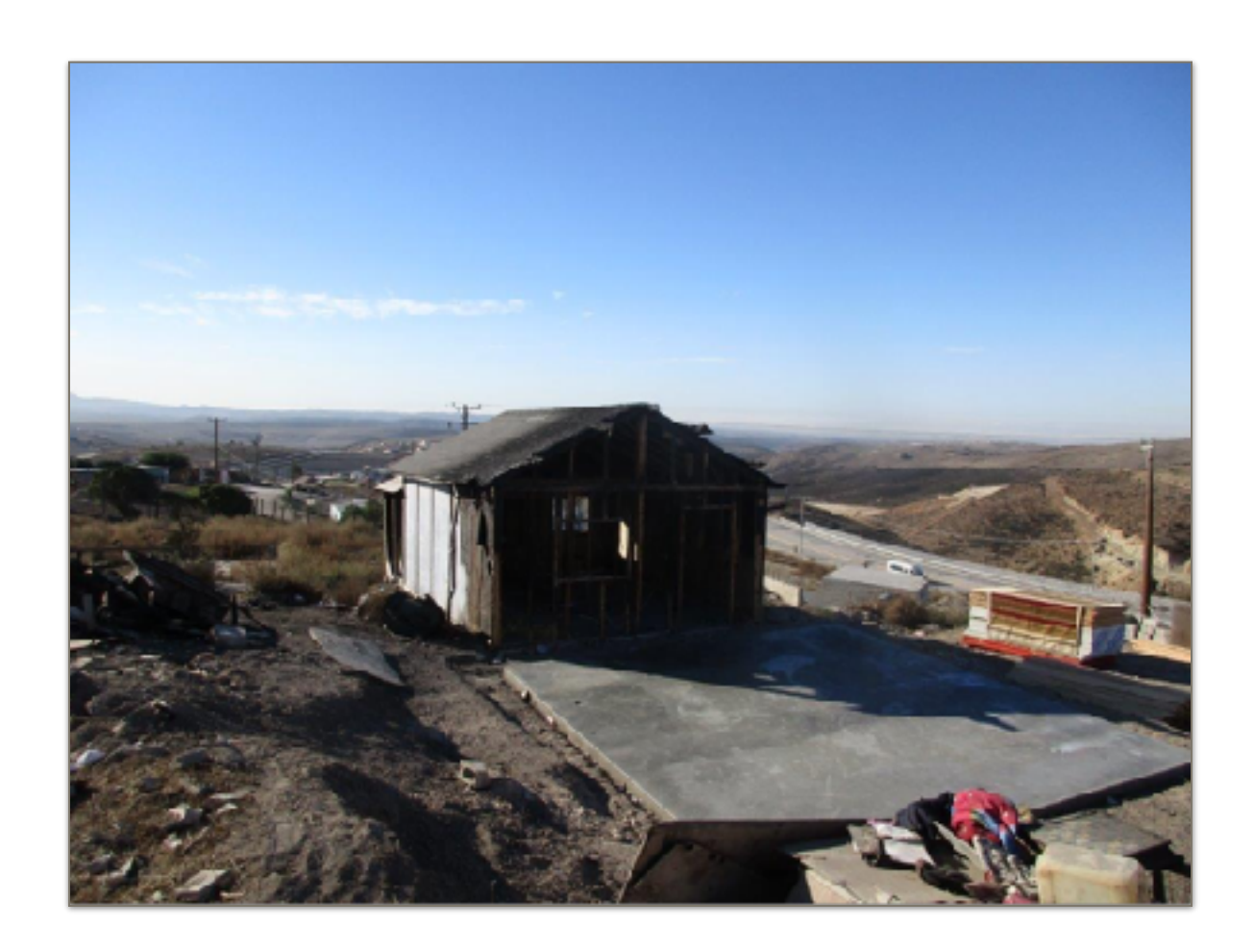
Photo of home for family of five that burned and concrete foundation for the new home.